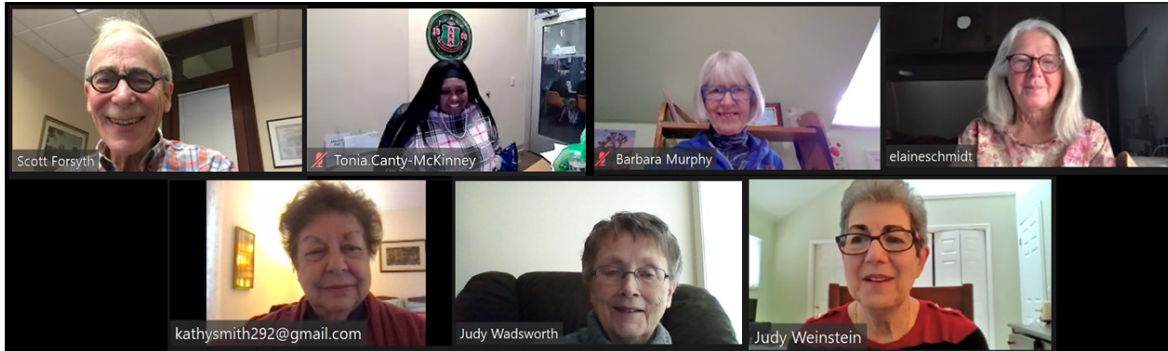
Some of LWV-RMA Government Committee members who met with the lawmakers and/or their aides in March.