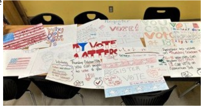
"Posters made by School Without Walls students during 2022 visit"