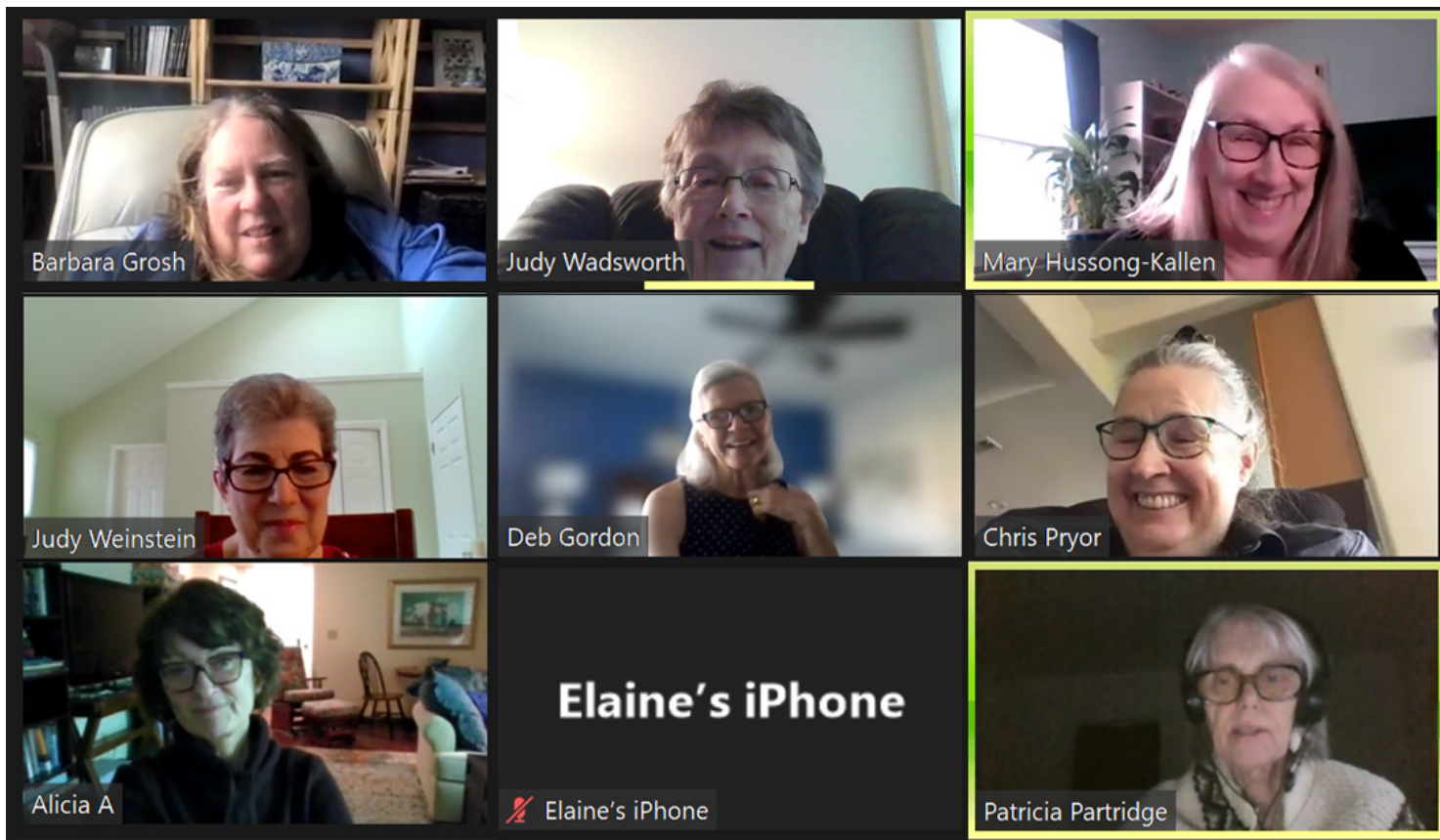
Book club members meeting via Zoom in February

LWV-RMA book club members met in February to discuss How the Word is Passed by Clint Smith.