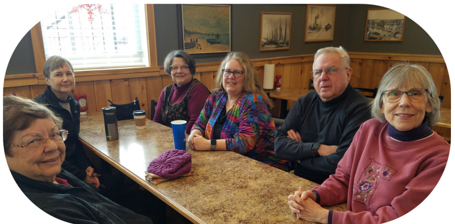
February First Friday on a cold 6 degree day.